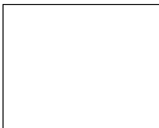
Photograph of Candidate

The signature and the photograph of the above named Thiru/Tmt / Selvi ..... are attested below