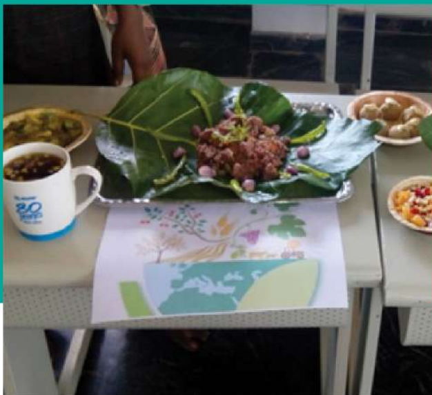
WORLD FOOD DAY